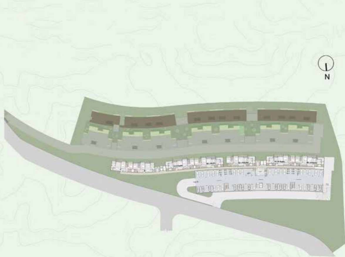
FLOOR PLAN AT BLOCK - 2