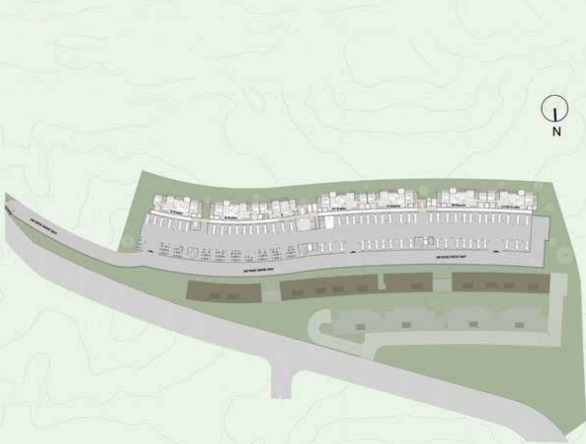
FLOOR PLAN AT BLOCK - 1