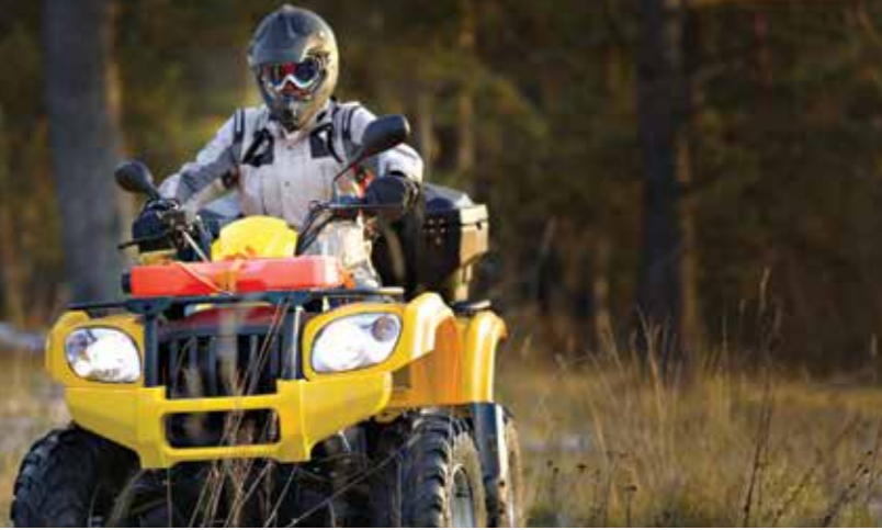
ATV – All terrain vehicles